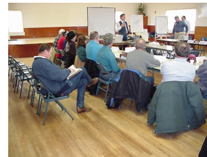
Basin Advisory Group meeting in Farson, Wyoming.

http://waterplan.state.wy.us/ We are constantly updating existing material and adding new work products.