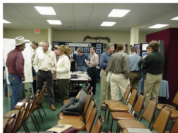
Newcastle Open House

• PLEASE FILL OUT AND RETURN THE EN- CLOSED FLYER. YOUR RESPONSE IS VERY IMPORTANT TO US.