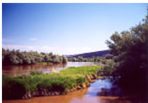
The Bighorn River North of Thermopolis.

During the last session of the Wyoming legislature, continued funding for a statewide water conservation program was approved. Conditional to this appropriation was that this program would become a part of the Water Development Commission. Subsequently, this program is now included with the River Basin Planning division of the Wyoming Water Development Office.