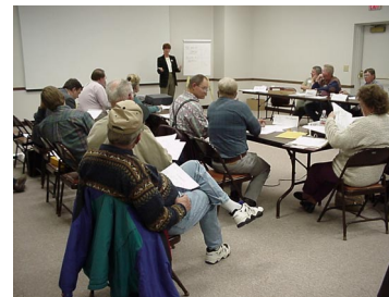
Basin Advisory Group Meeting in Evanston.

Individuals in the Green River Basin charged with forming a BAG felt that it was important to include everyone as a BAG member, and there was to be no distinction as to who “sat at the table” and who did not. Anyone who attended the meeting could be a BAG member. Due to this “open” approach, BAG membership is more than 100 persons, with attendance averaging around 50 per meeting. Furthermore, given the expanse of the basin, meetings are rotated between each of the sub-basins. As before, the group operates on a consensus-based approach, as no votes are taken. Meetings occur on a monthly basis.