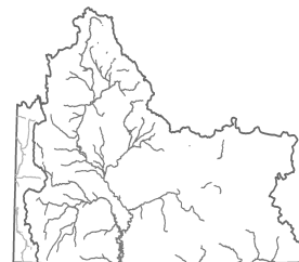
Map of the Bear and Green River Basins

Both teams were given the notice to proceed in July of 1999. The Bear River final report is due October 2000, while the Green River final report is due December 2000.