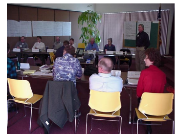
Green River BAG members working on issue development.

Concurrent with the BAG meetings the members requested informational presentations on water issues. This has been an excellent way for the BAGs to receive updates on compact issues, endangered species concerns, water project operations, inter-state negotiations, etc. The BAG also requested presentations from local water interests relative to each meeting location. These have been